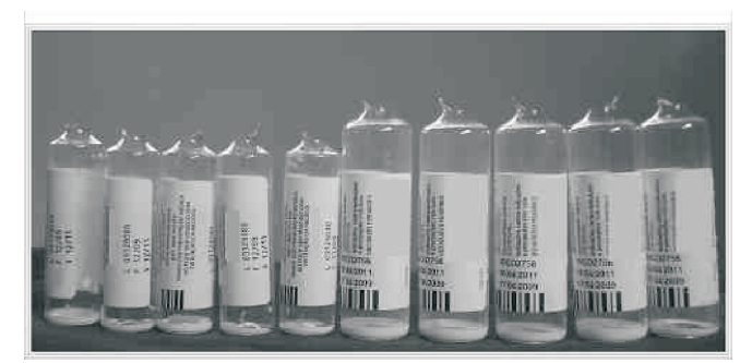
Figure 5 – Vertical Projections on the Opening Border of Propofol Ampoules (10 and 20 mL).

In specific cases, such as manipulation of ampoules containing chemotherapeutic agents, gloves are recommended. Ampoules should always be discarded in recipients for sharp edge materials.