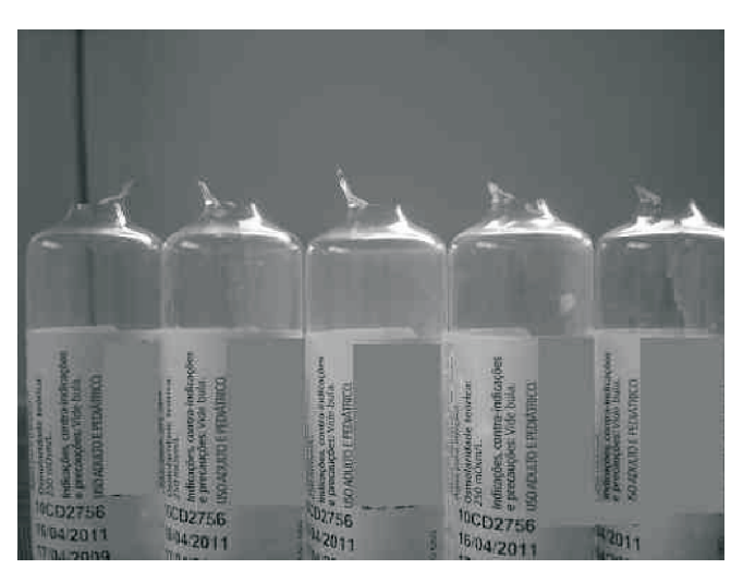
Figure 4 - Vertical Projections on the Opening Border.