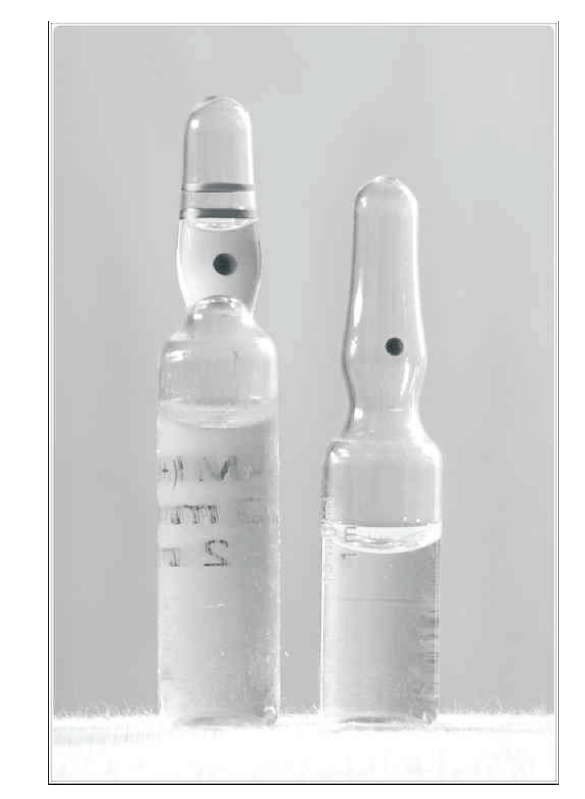
Figure 2 – OPC System.