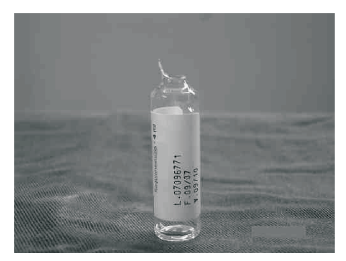
Figure 6 – Vertical Projections on the Opening Border of a 4 mL Ampoule.

Regarding the risk of professionals that manipulate ampoules, there is an important flaw on breaking open some of them. After opening, there is a tendency to produce sharp edge vertical projections that increase the risk of injuries. Larger ampoules and with a greater orifice are at greater risk of producing such projections. This is due to the greater irregularity of their opening border <sup>11,12</sup>. Since 1997, notable irregularities on the opening border of propofol ampoules (Figure 4) have been questioned <sup>11</sup>. In the present study, propofol ampou-