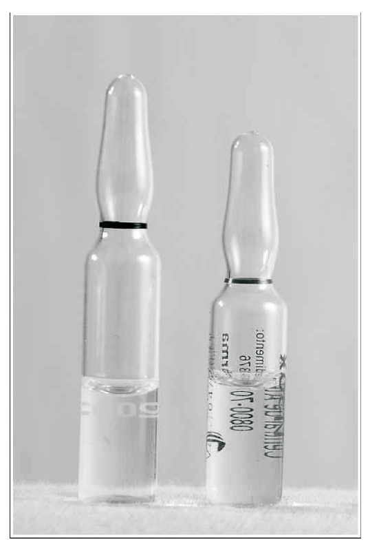
Figure 1 -VIBRAC System.

Figure 3 shows a safe way of opening ampoules with facilitating systems.