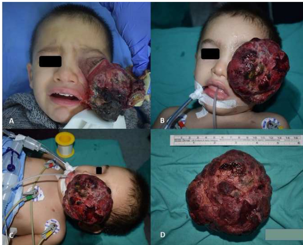
Figure 2 (A) Image of the patient after three cycles of chemotherapy. (B and C) Peroperative images of the patient. (D) The excision specimen was measured to be 20 × 16 × 11 cm.