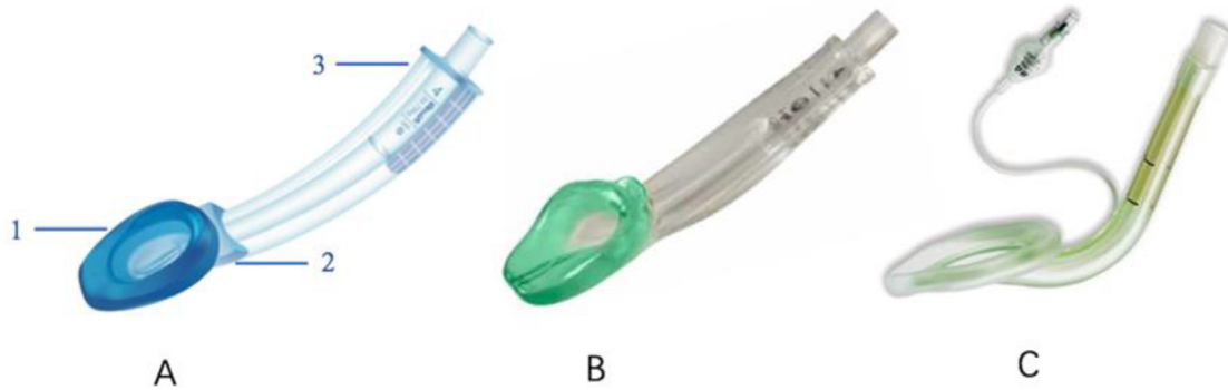
Figure 2 The view of 3 types of laryngeal mask. A, GMA; B, i-gel; C, inflatable LMA; 1, non-inflatable gel-like cuff; 2, tongue base rest; 3, C-channel for gastric tube insertion.