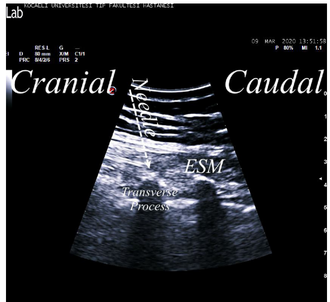
Figure 1 Ultrasound image of erector spinae plane block. ESM, erector spinae muscle.

Patients were randomly allocated to two groups: Group A (Unilateral) and Group B (Bilateral). The sequence was done using www.random.org and the allocation sequence was concealed in sealed opaque envelopes, which indicated the treatment to be assigned to the patient. All the patients received preoperative bilateral or unilateral ESP block at the T8 level preoperatively according to their groups. All the blocks have been done 20 minutes before the surgery in a separate block room. All blocks were performed by experienced anesthesiologists with no involvement in patients' perioperative follow-up and data collection processes.