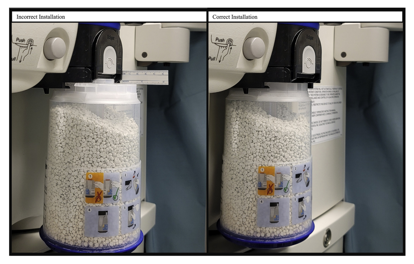
Figure 1 Installation of the carbon dioxide absorbent canister.

allowed timely ventilation and oxygenation of the patient, minimizing harm.