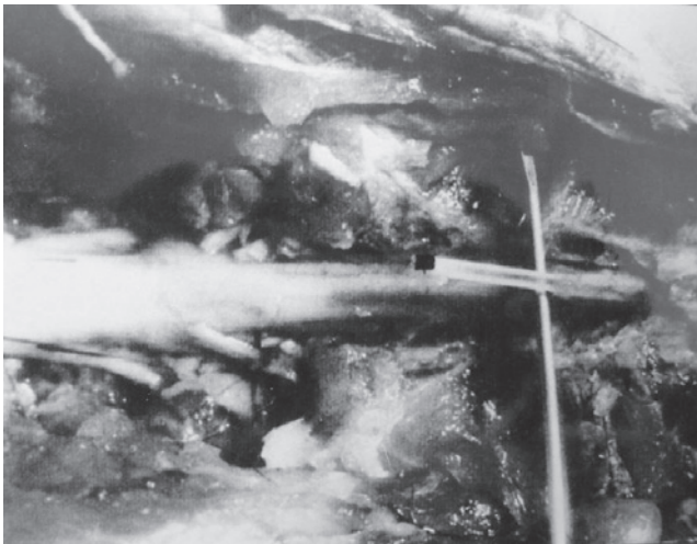
Figure 3 Catheter placement verified by laminectomy.

seen during this period. Laminectomy performed after animals killing on the tenth day revealed that the catheters were in the epidural space in all rabbits (Fig. 3).