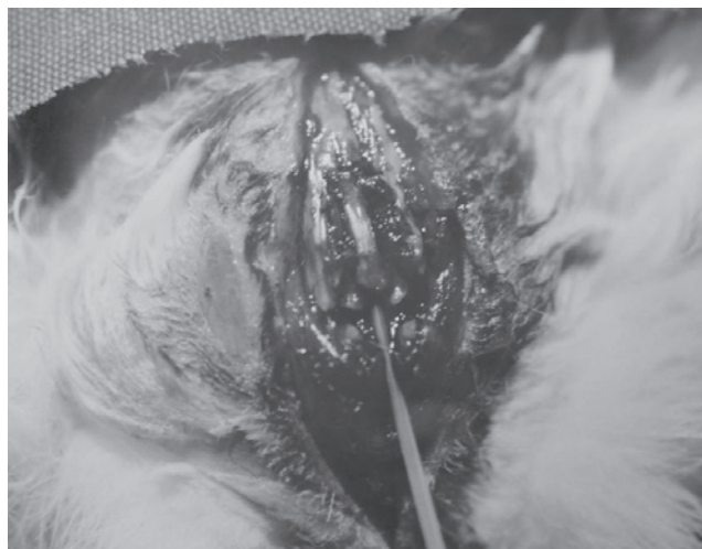
Figure 1 Catheter carried forward through sacral hiatus.