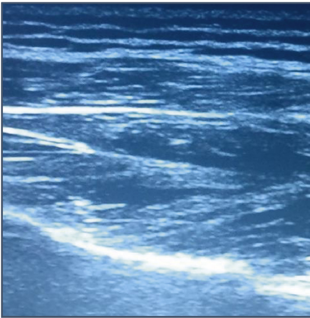
Figure 1 Ultrasound identification of the suprascapular nerve in the suprascapular notch.

Impression of Change Validated Portuguese (PGIC-VP) questionnaire immediately and six months after the procedure. In this unidimensional tool, patients report their treatment improvement on a 7-item scale, with 1 representing “no change” and 7 representing “a great deal better”. 21